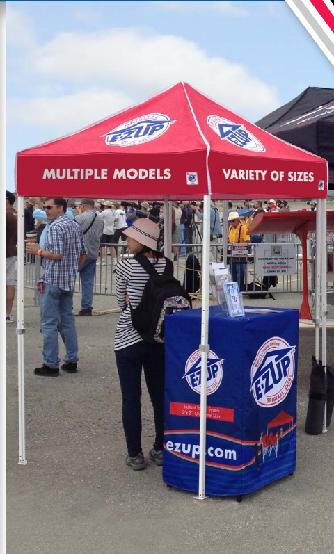
*Shown with imprinted top and valance.

The new VUE™ Professional Shelter is packed with new features. It's the perfect promotional tool to maximize branding when space is limited.