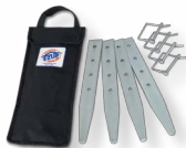
HEAVY-DUTY STAKE KIT