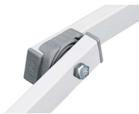
E-Z Glide Truss Washers Allow for Increased Stability