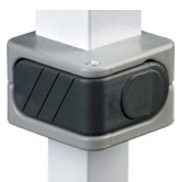
Toggle Leg Adjustment System