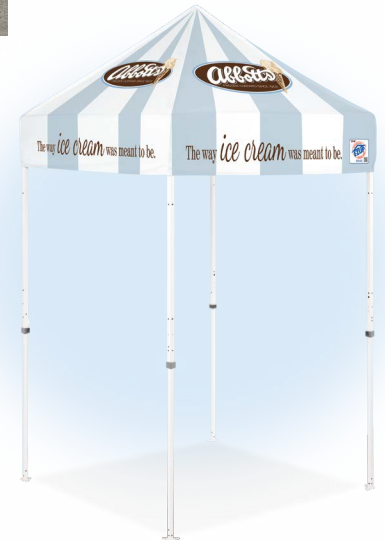
5' x 5' (1.5 m x 1.5 m) VUE™ *Shown with full-bleed digital graphics.