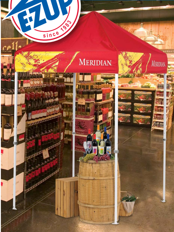
*Shown with digital valance.