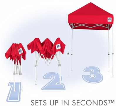
SETS UP IN SECONDS™