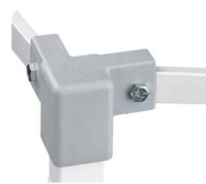
High Strength End Cap for Greater Durability