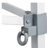
Pull Pin Slider for E-Z Quick Lock and Release