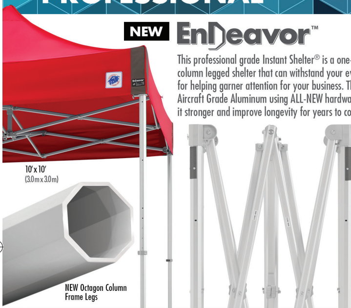
10' x 10' (3.0m x 3.0m)

This professional grade Instant Shelter® is a one-of-a-kind, eight-sided, column legged shelter that can withstand your everyday use and is ideal for helping garner attention for your business. The frame is constructed of Aircraft Grade Aluminum using ALL-NEW hardware & technology to make it stronger and improve longevity for years to come.