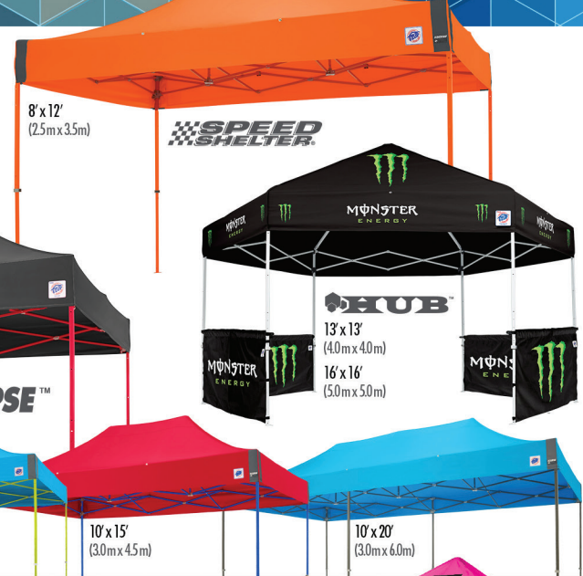
10' x 10' (3.0m x 3.0m)